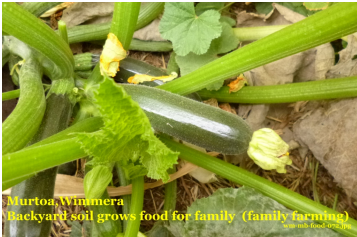
Murtoa, Wimmera Backyard soil grows food for family (family favourite)