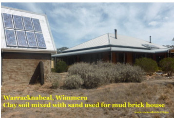
Warracknabeal, Wimmera Clay soil mixed with sand used for mud brick house