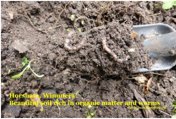
Horsham, Wimmera Beautiful soil rich in organic matter and nutrients

This email updates the progress “Soil Selfies” project through August If this is the first time you have received an update from me, as I have only met you recently, please add this email address to your safe senders. Please, if you do not want to receive updates, email me to take you off my list. But you may also suggest people to add! Thankyou.